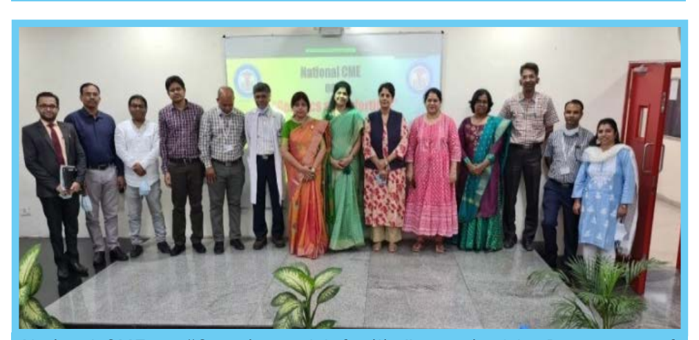
National CME on "Genetics and Infertility" organized by Department of Anatomy AIIMS, Raipur on 30.10.21