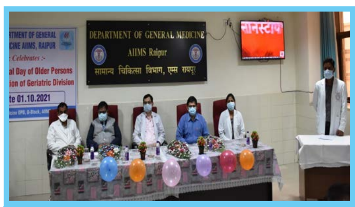
Inauguration of "Geriatric Division" on 01/10/2021