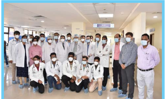
Inauguration of "Critical care unit" on 01/07/2021