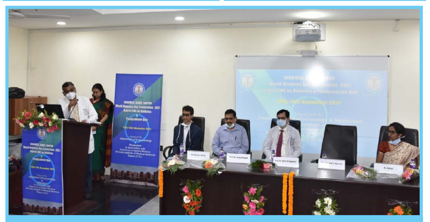
Hybrid CME- "ENDOMED" in association with Dept of Endocrinology, on world Diabetes day-13th-14th November 2021