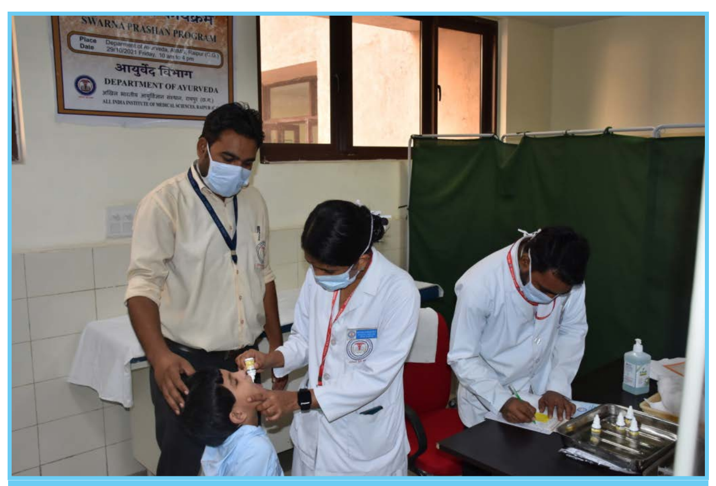
Swarna Prashan An Effective Ayurvedic Immune Booster for Children

by the Department of Ayurveda. This program runs only in two National organizations in the Country; AIIMS Raipur is one among them. Around 700 beneficiaries are getting benefitted from this program. 650 therapeutic procedures were conducted in Unani OPD.