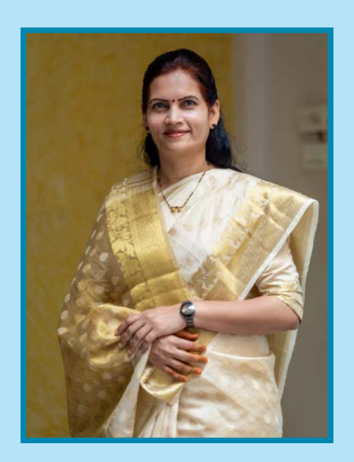
Dr. Bharati Pravin Pawar Hon'ble Minister of State Ministry of Health & Family Welfare, Gol